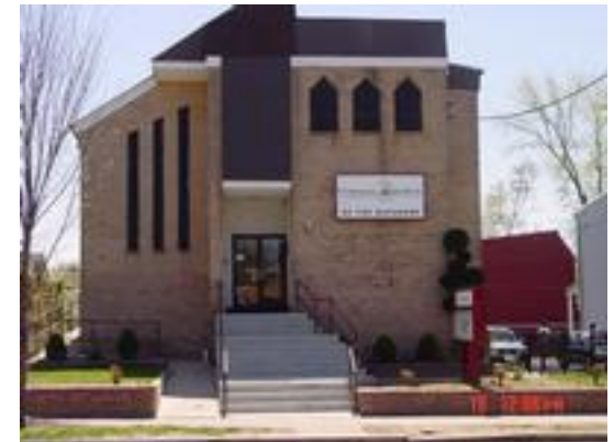
Community of Hope Church of the Nazarene 905 Alabama Ave SE Washington, D.C. 20032 www.hopenaz.com