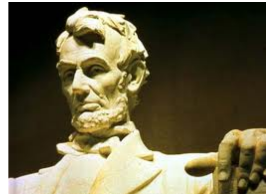
Abraham Lincoln Memorial